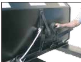
Safety Lock prevents accidental tripping of bucket during transportation.

Heavy duty construction and a dependable trip mechanism ensures long trouble-free life. An affordable low cost makes this bucket easy to justify even for the occasional user.