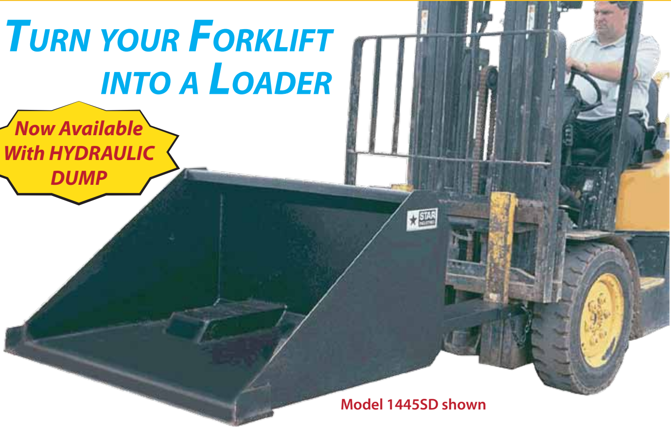
Model 1445SD shown

Slips on the forks - Installs in minutes