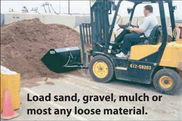
Load sand, gravel, mulch or most any loose material.