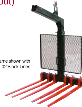
Model 660 Frame shown with Model 660-02 Block Tines